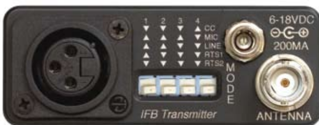
The rear panel provides the audio input and programming DIP switches for intercom and audio input type along with power and antenna input jacks.

The DSP algorithm can operate in the native, compandor-free hybrid mode with Digital Hybrid receivers, or in a compatibility mode for use with IFB R1a receivers. When used with the R1a receiver, the system operates in the analog IFB mode with compandor noise reduction. When used with Digital Hybrid receivers, the system can operate in the compandor-free hybrid mode.